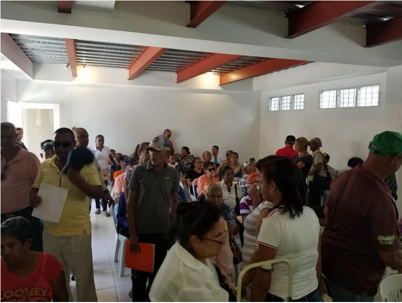
Patients waiting in the new office in Moca