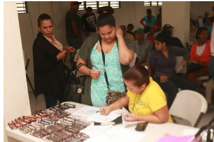
Patients choosing frames.