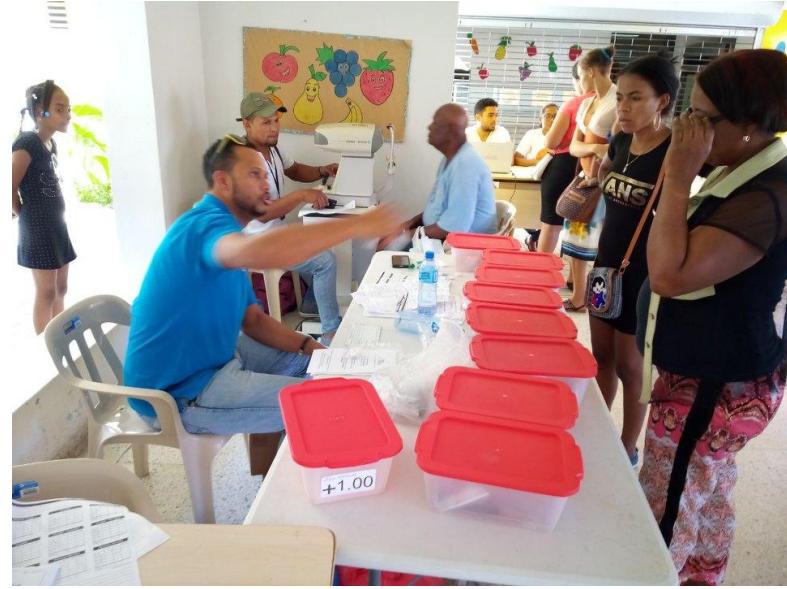
Providing reading Glasses to patients in Santo Domingo