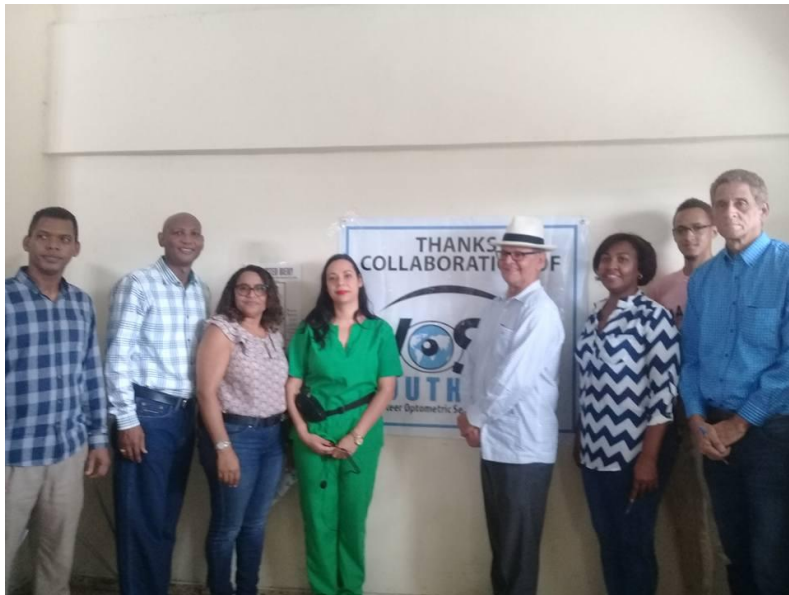
The Senator's of the Sanchez Ramirez Province